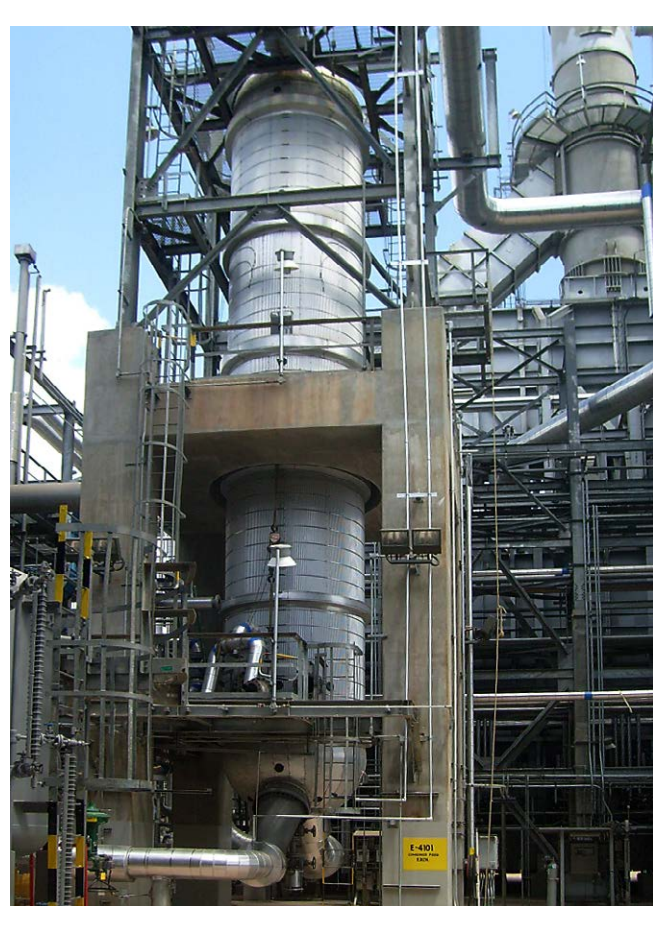
Packinox heat exchanger installed in a catalytic reforming unit.

Each Packinox heat exchanger is designed and built to the exact conditions it will operate under. Performance is optimized by the right selection of plate pattern, gap distance, plate dimensions, number of plates, \Delta T and pressure drop. The result is outstanding performance and high cost efficiency.